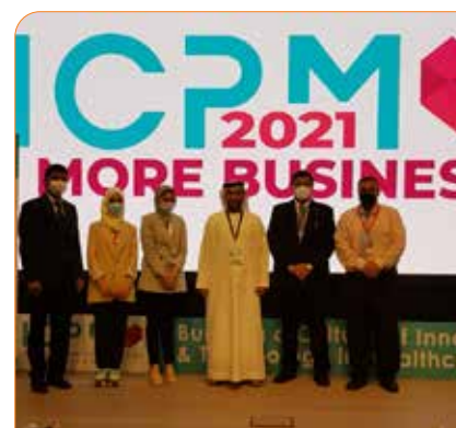
The 5th ICPM Conference and Exhibition The university's participation was represented by establishing an interactive platform aimed at introducing visitors of the ...