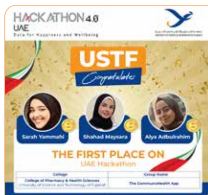
A USTF Victory: Our Experience Winning The UAE Hackathon 2021 Amidst the COVID situation, as we began a new spring semester, we constantly felt the need to support the community we live...