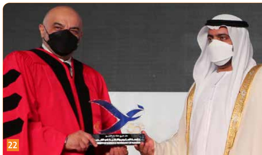
Fujairah Crown Prince attends the First Graduation Ceremony at USTF Under the patronage and in the presence of His Highness Sheikh Mohammed Bin Hamad Al Sharqi, Crown Prince of Fujairah, Chairman of the Board of Trustees....