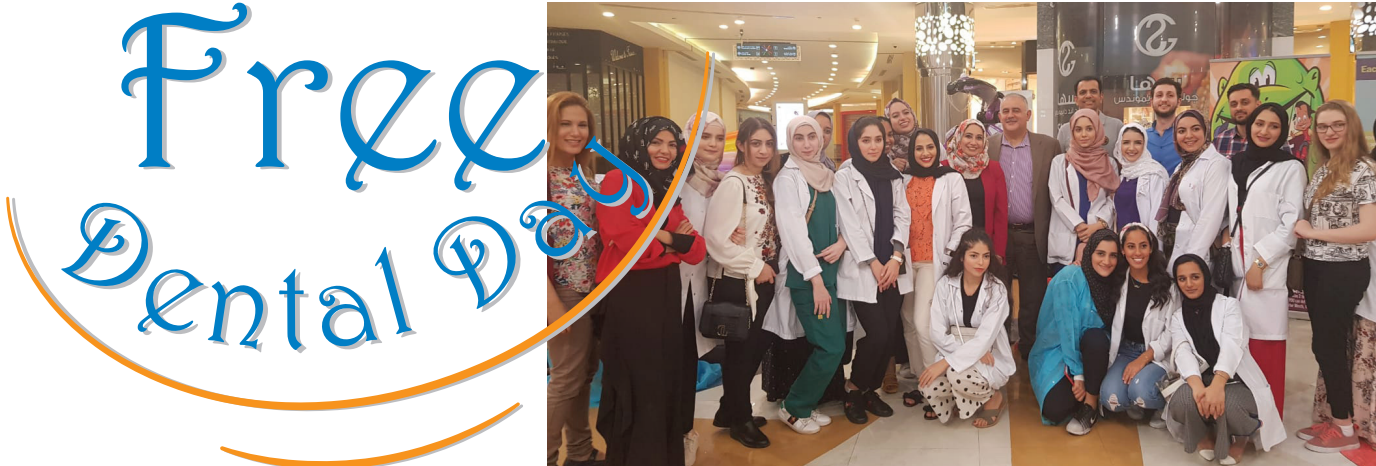
USTF, College of Dentistry participation in Free Dental Day event at Lulu Mall –Fujairah